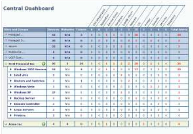
Web-based Central Dashboard