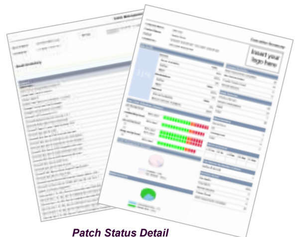
Patch Status Detail Server Health Report