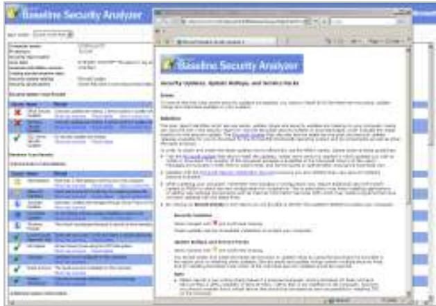
Microsoft Baseline Security Analyzer Report