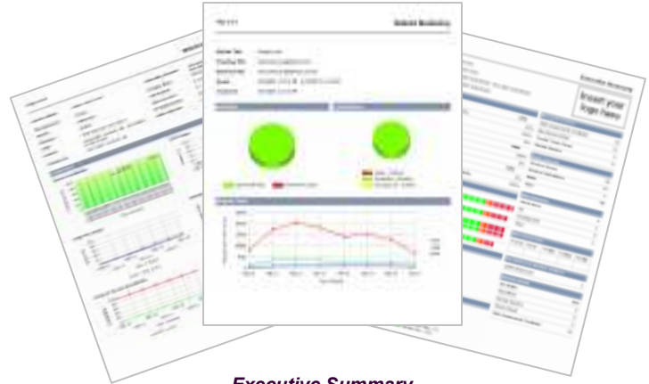
Executive Summary Website Availability Site Performance