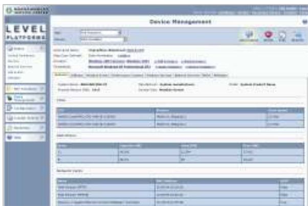
Device Management – Hardware/Software